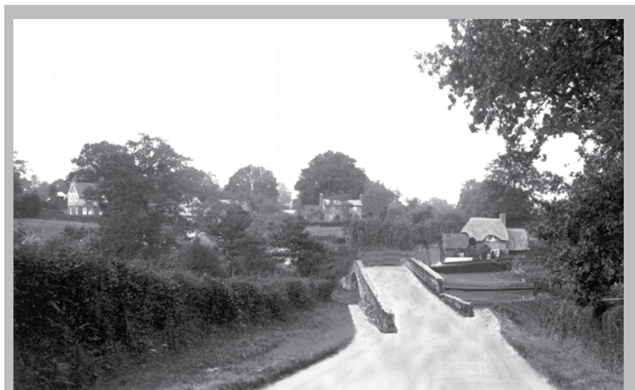
A computer enhanced photograph of Dix Hill showing an artist's impression of what the canal might have looked like at Honey Mill Bridge (see map at top of page 3).

The need for a wharf is vital if an area is to become a centre for growth and industrial activity. It would have provided the warehousing, loading and unloading facilities as well as landside support such as horse drawn transport and commercial activities. A successful wharf at Tadley would have enabled associated trades to flourish as well as allowing local industries to gain direct access to markets in distant towns and cities.