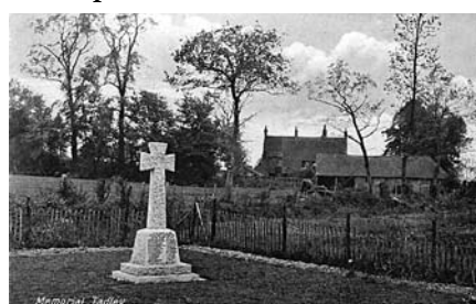
Tadley War Memorial at the junction of New Road and Mulfords Hill, 1927-1963.

At this time of year the nation honours those who gave their lives in the service of their country. In this issue of projectnews we highlight three of those named on the Tadley War Memorial. No information has been found about the initiation of the Tadley War Memorial project. It is probable that a committee was set up, as in other villages, but no reference has been found in parish council or church vestry records from 1918 to 1929 to the provision of a stone monument. The earliest reference so far found